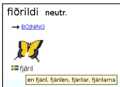
Figure 2: The inflectional forms of the Swedish word fjäril 'butterfly' become visible with mouseover.

Grammatical information. This includes case government of the Icelandic verbs and prepositions, among other things. Some grammatical information on the TLs is provided too, e.g. the plural of nouns and past tense of verbs. The different TLs have different solutions for how to display this, but in all instances the morphology is shown by a mouseover of the equivalent. This feature is currently available for Danish and Swedish only.