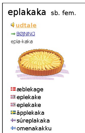
Figure 1: Eplakaka 'apple cake'. The simplest type of an entry in ISLEX with its six target languages.

The target groups of ISLEX are Icelandic speakers with medium to advanced knowledge of the other Scandinavian languages, and Scandinavians with limited to advanced knowledge of Icelandic, e.g. teachers, students and translators. In fact, all those who need a modern dictionary between Icelandic and the other Nordic languages. The dictionary is thus intended to be bifunctional, which is necessary in the case of Icelandic as such a small language society does not have the capacity for publishing many kinds of dictionaries, aimed at different target groups (cf. Sanders, 2005).