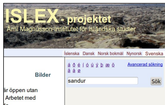
Figure 6: The simple search form of ISLEX. The metalanguage is Swedish. The search combines the Icelandic lemmas' base form, their other inflectional forms, and the TLs' equivalents.

The use of the dictionary is relatively straightforward. The search combines the Icelandic lemmas' base form, their other inflectional forms, and the TLs' equivalents. This functionality can doubtless still be improved, cf. Sanders' critical assessment (2013). The ISLEX user interface also offers advanced search with more options, but this feature is currently being revised.